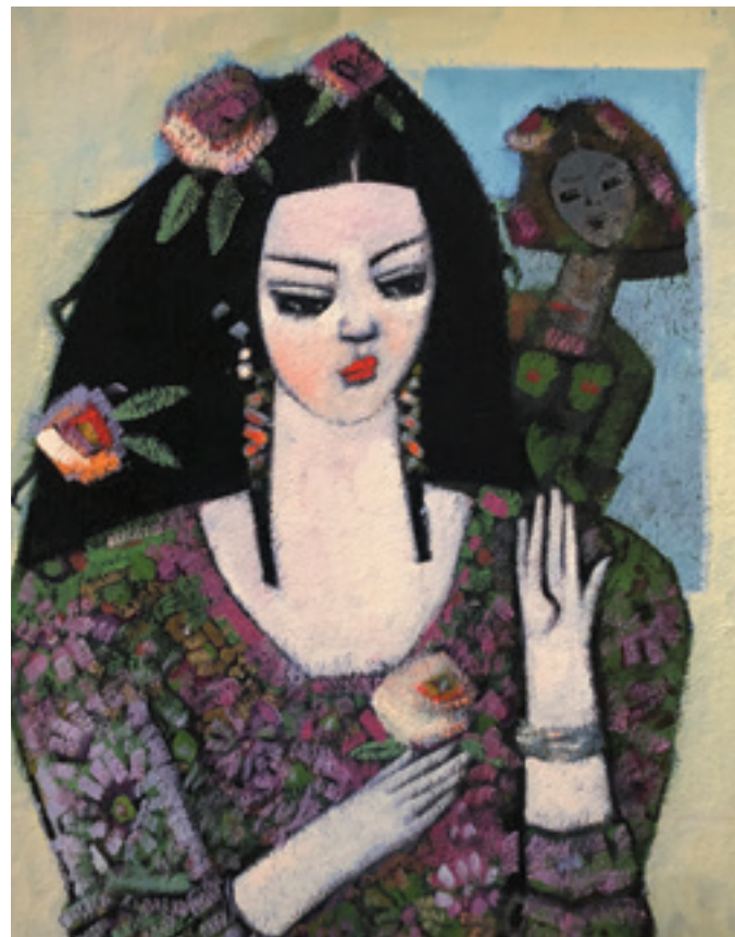
Holding a Flower, 44 x 35cm, Oil on Board