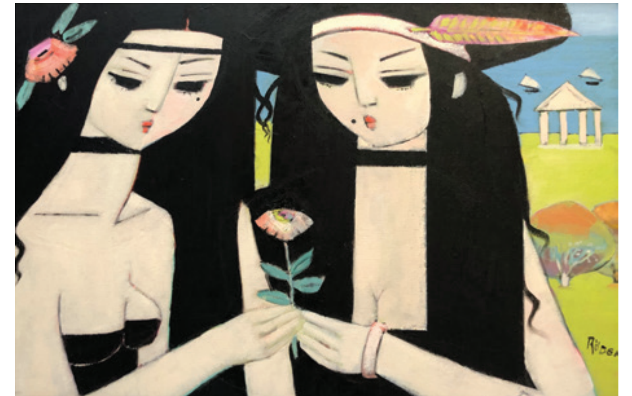
Temple, 51 x 76cm, Oil on Board