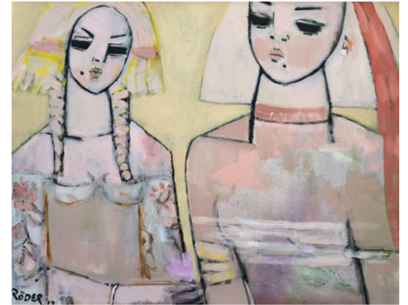
Friends, 60 x 76cm, Oil on Canvas