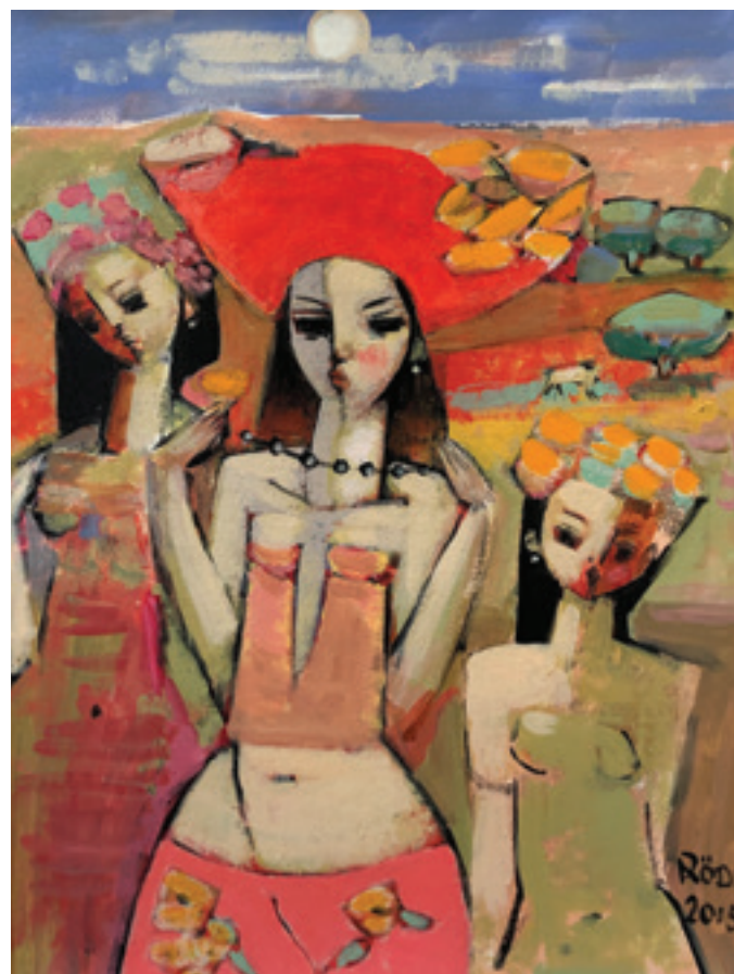
The Necklace, 60 x 45cm, Oil on Board