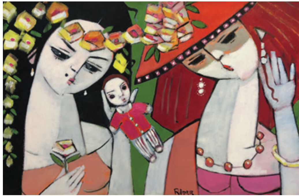
Small Rag Doll, 50 x 75cm, Oil on Canvas