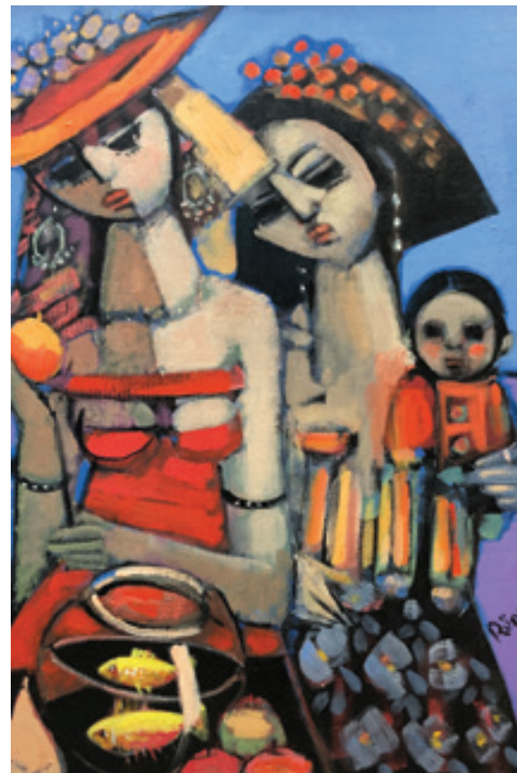
Goldfish, 73 x 47cm, Oil on Board