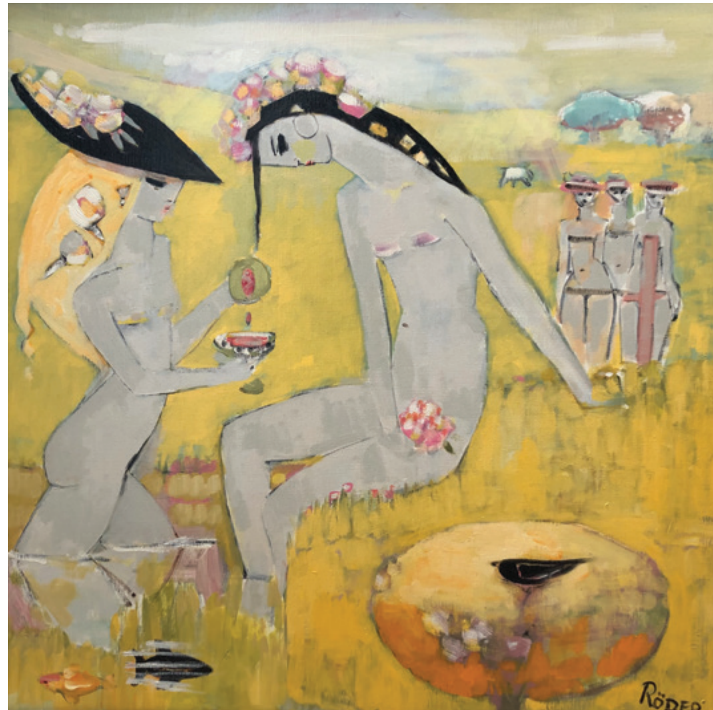
By a Different Light, 76 x 76cm, Oil on Canvas

This is a small selection of paintings from the exhibition. Please visit our website at www.cattogallery.co.uk to see the whole collection.