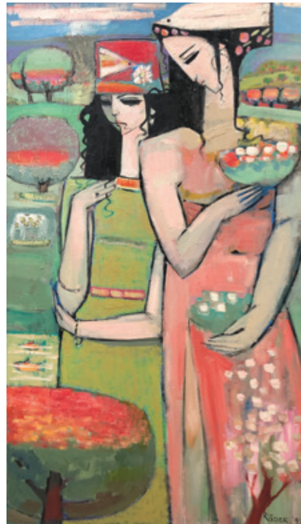
Country Walk, 102 x 60cm, Oil on Board