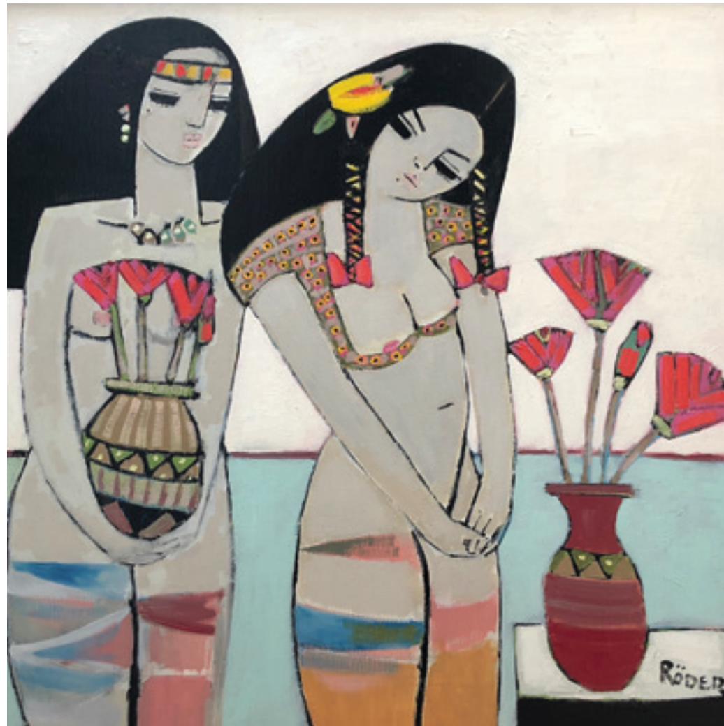
Egyptian Flowers, 75 x 75cm, Oil on Canvas